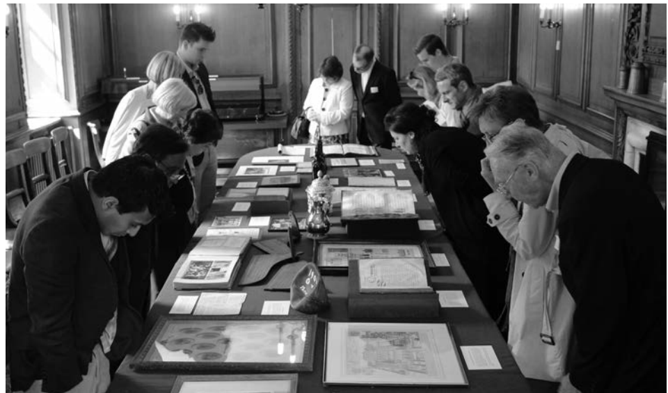
Archive exhibition at the Parents Lunch in May

Shrewsbury School Simon Langton School for Boys, Canterbury Sir Henry Floyd Grammar School, Aylesbury Stonyhurst College, Lancashire Stowe School, Buckinghamshire Stratford Girls' Grammar School, Stratford Upon Avon Taylor's College, Malaysia The Downs School, Berkshire The Judd School, Tonbridge The Portsmouth Grammar School The Windsor Boys' School Vienna International School, Austria Westminster School, London Withington Girls' School, Manchester Wycombe Abbey School, High Wycombe