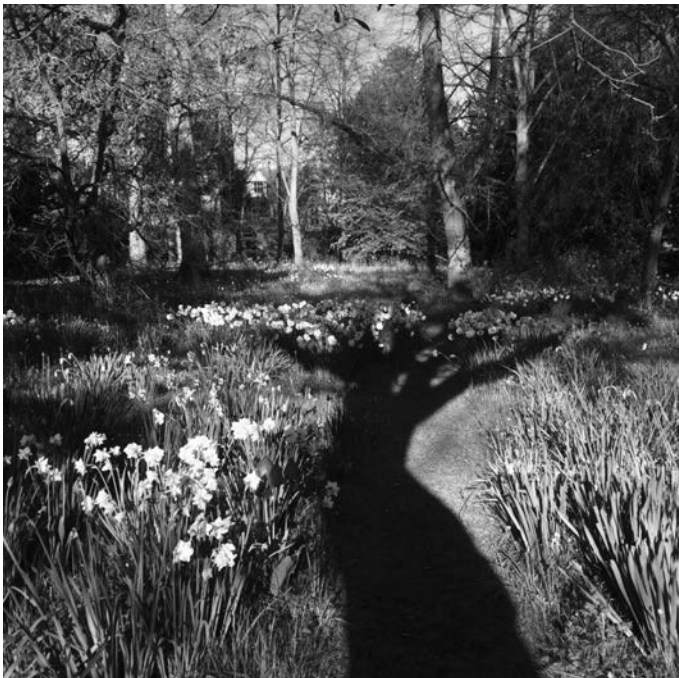
Unusual tree found growing in the Wilderness!

Looking at the many show gardens, those which replicated a particular landscape were definitely the talking point. Gardens which particularly intrigued us were James Basson's L'occitane Garden, inspired by Provence, and Martin Cook and Gary Breeze's incredible garden set within a granite cube, both showing how nature can claim a desolate landscape. Our observations from the show gardens