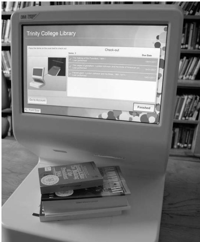
The new self-issue terminal in the library

The new self-issue terminal and accompanying security gates, installed last summer, have proved much more reliable than our previous system, which was getting a little creaky in old age. The 3M terminal works on radio frequency (RFID) technology—issuing a book and disabling the security alert by reading a microchip tag inserted into the book cover. Books are issued by being piled on to the scanner pad after the reader’s University Card has been recognised. The whole process is quick and easy, using a touch screen, and has replaced paper with emailed check-out receipts. Management software enables the collection of a range of loan statistics and the easy customisation of messages and display. In the coming year we hope to test the new inventory control system, a