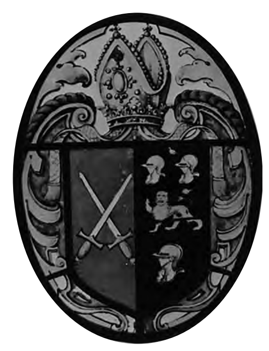
Intended for the Hall: painted glass removed from the Old Library south window in 1954

was only a year away, and he felt 'most anxious to get all the old glass back into our library' before he departed.