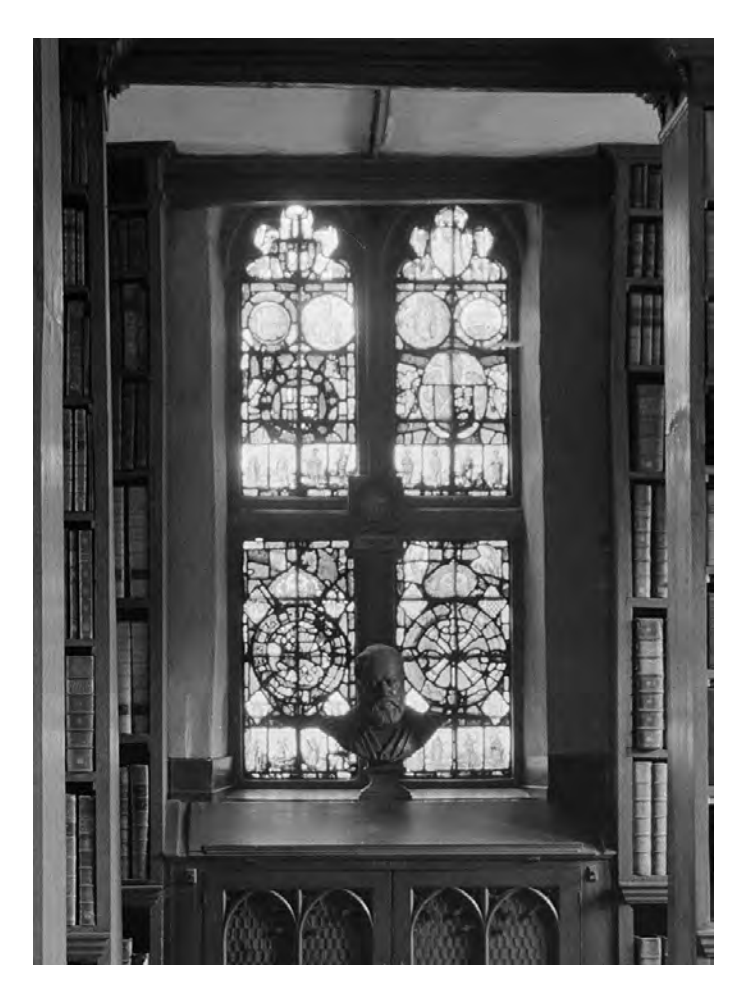
The 1765 south window, photographed in 1930 for Country Life, detail, reproduced by kind permission of Country Life Picture Library

Three-quarters of a century later, in September 1954, Sir Arthur Norrington assumed the Trinity presidency. Over fifteen years he was to oversee the transformative refacing of Trinity's buildings and the bold construction of a new quadrangle. Less well remembered,