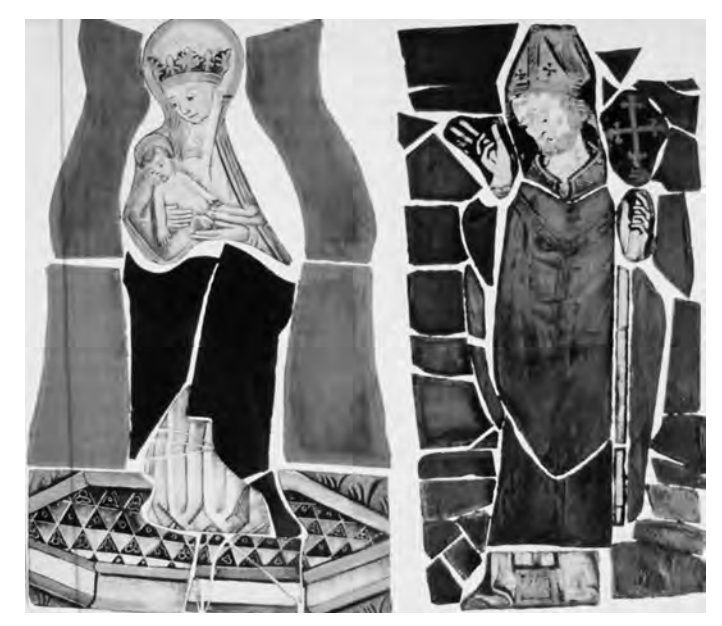
A jigsaw of painted glass... which became the lower right quarter of the new south Window, 2007.

As the Library enters its seventh century, much thought is being given to the future protection of the windows. On the advice of York Glaziers, the inner Perspex layers have already been removed from the east windows, and discreet 'grills' inserted to allow air to circulate between the outer panes and the painted glass. It is of course ironic that large library windows—of great benefit to readers in the dimly lit Middle Ages—are now known to be harmful to books. The high levels of ultra violet light entering through the east and south windows is damaging both the appearance and structure of volumes shelved on the east side of the library. The clear-glazed west windows were some years ago fitted with UV-resistant film, but aesthetic and conservation concerns make this a less feasible solution for the painted glass. York Glaziers are working with a new type of UV protective glass (restauro® UV) in which the light resistance is part of the glass itself. Developed by Glasshuette Lamberts of Germany, the glass is mouth blown in the traditional