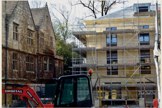
View of the Levine Building from Library Quad (April 2021).