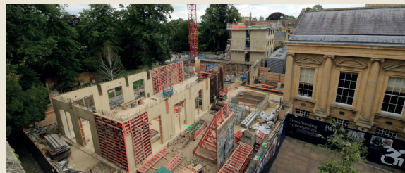
August 2020: eastern 'Teaching Wing' at its full height and the western wing, which will house the community space, administrative hub and student accommodation, beginning to rise in front of Library Quad.

The 'Teaching Wing' reaches its full height and work begins on its exterior rubblestone facing. The rest of the building also begins to rise, and each of the public spaces is now identifiable, namely the auditorium, multipurpose function room and informal study/community area, which will house the 'Dodecadents Bar'. The Britton Library Foyer—named after former Honorary Fellow Jack Britton—now links the Levine Building to the War Memorial Library.