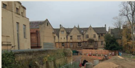
Before and after the demolition of the Cumberbatch Building.

Trees are cleared from the site. Diseased trees are disposed of via Europe's largest wood chipper; other wood is saved for projects throughout College. At the same time, half a mile of new hedging, including trees, is planted on Trinity's Wroxton Estate in North Oxfordshire. The Stuart Gates are removed for restoration and the temporary 'Lawns Pavilion'—providing a teaching room and a large reading room (an alternative study space to the Library)—is constructed on the Lawns.