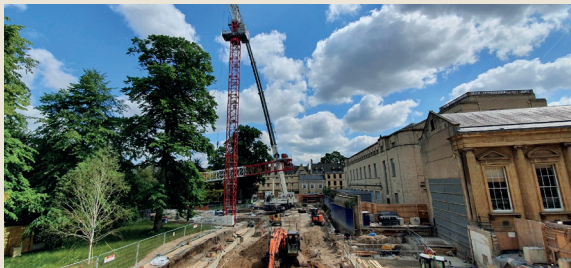
The site's crane has become a prominent feature in the Oxford skyline.