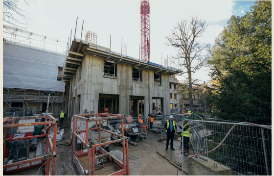
The multipurpose function room, on top of which there is a roof terrace, looks out onto the Wilderness.

www.trinity.ox.ac.uk/levine-building-gallery