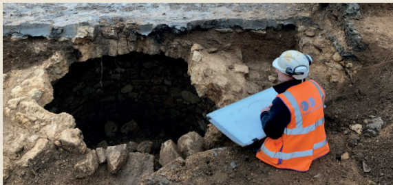
A large stone chamber believed to be the remains of a water feature.